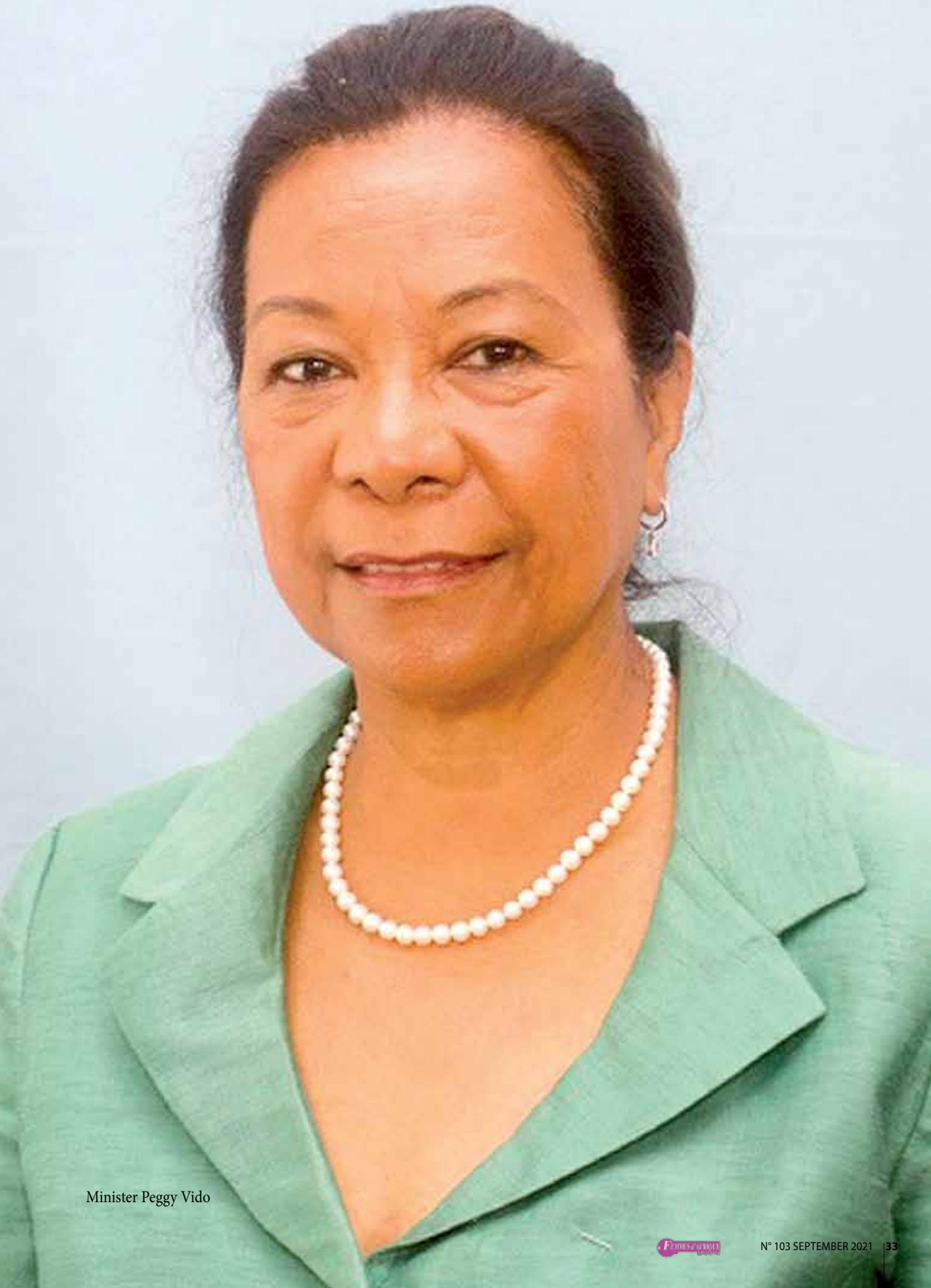
Minister Peggy Vido