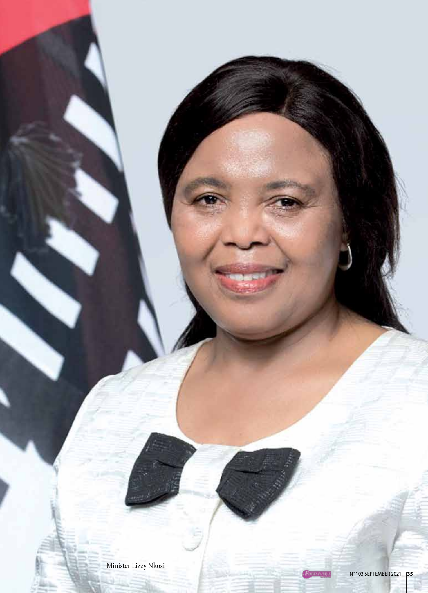
Minister Lizzy Nkosi