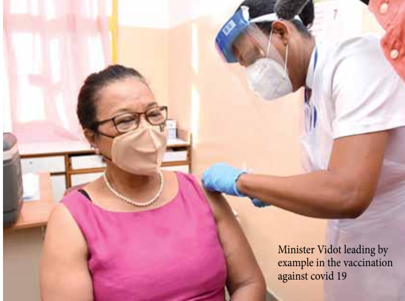
Minister Vidot leading by example in the vaccination against covid 19

During the ongoing pandemic, many Africans resorted to African traditional medicines. Is that an explanation to the still unanswered question of Africans’ relatively low covid 19 death tolls? Whatever the response, the pandemic has pushed African governments to renew their attention to African local