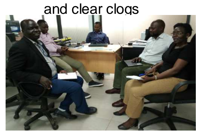
Figure 2: Key Informant Discussion with Water sector focal points in Luzira, Uganda during field assessment