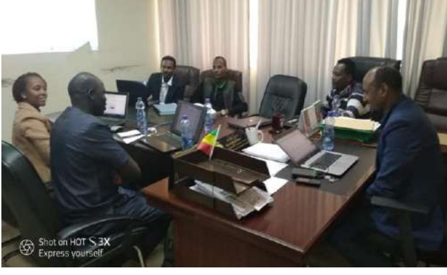
Figure 3. Key Informant Discussion with Agriculture sector focal points in Addis Ababa, Ethiopia during field assessment