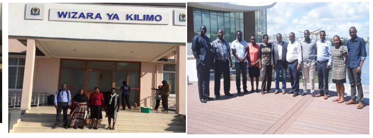
Figure 4. Key Informant Discussion with Agriculture sector focal points in Tanzania